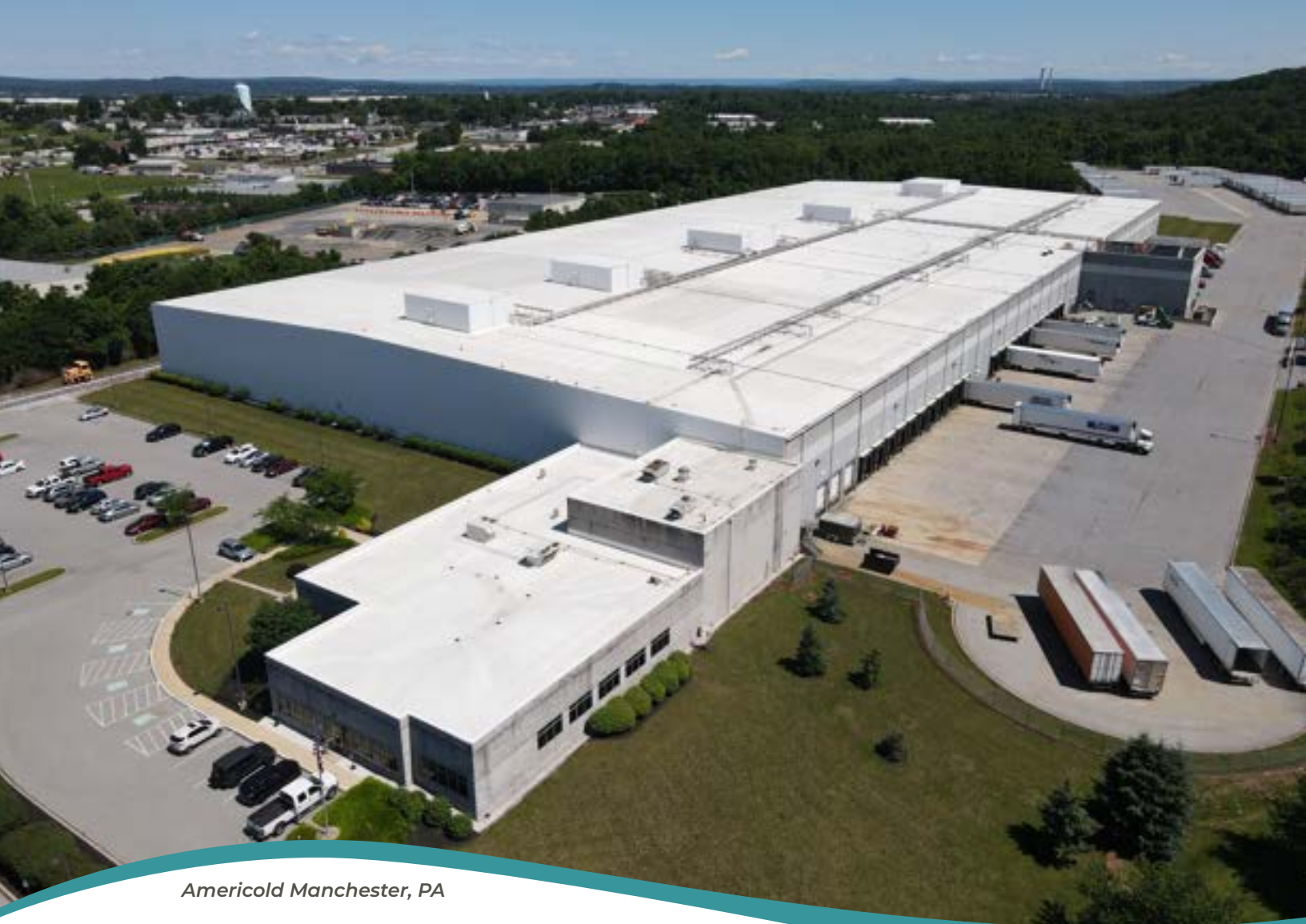
Americold Manchester, PA