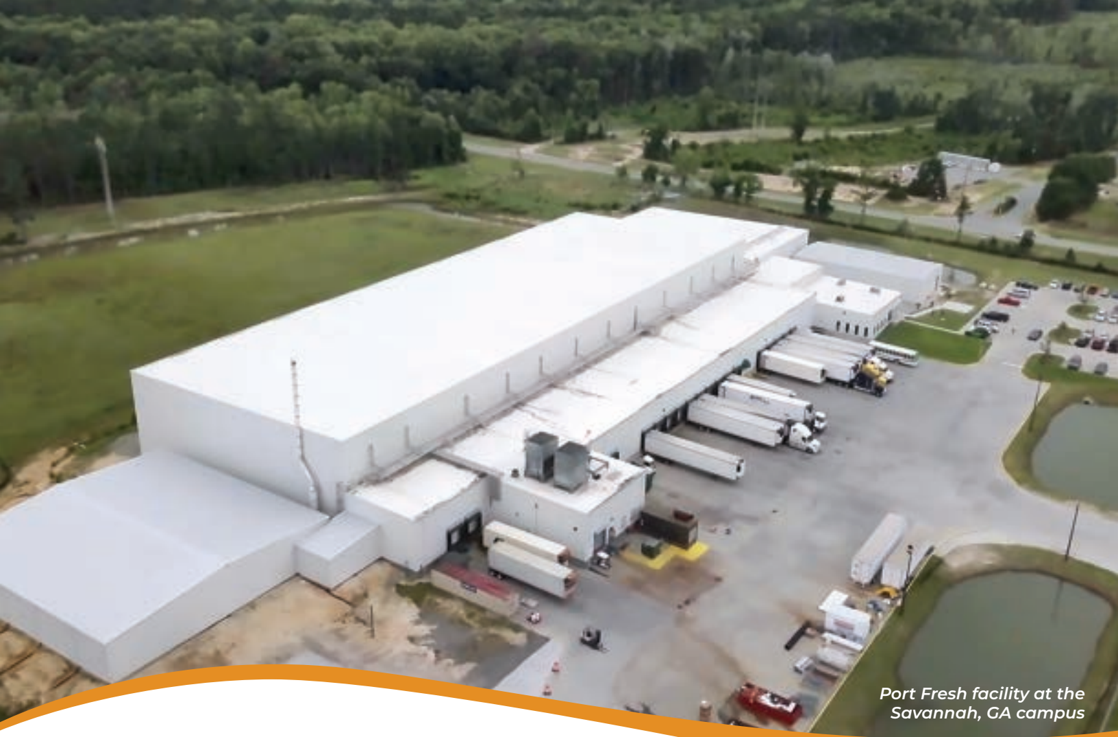
Port Fresh facility at the Savannah, GA campus