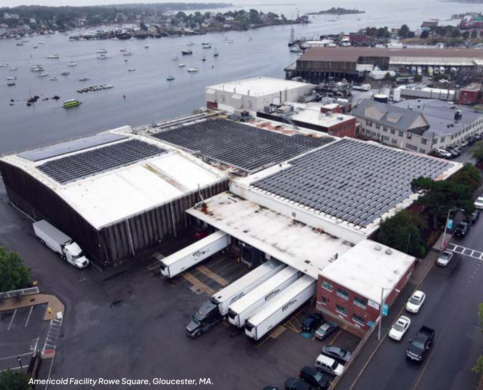
Americold Facility Rowe Square, Gloucester, MA.